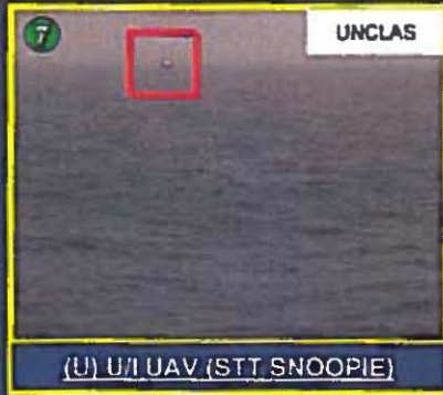
(U) U/I UAV (STT SNOOPIE)