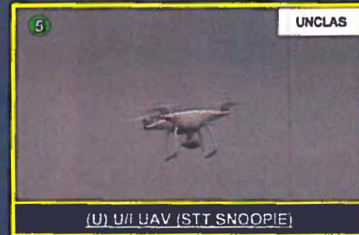
(U) U/I UAV (STT SNOOPIE)